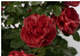
Desert Sky™ - Compact, Bushy, 2 1/2' h x 2 1/2' w

Floribunda includes a wide variety of roses that are known for their large clusters of flowers. Many are bred to be more disease resistant. They tend to have a more bushy and compact growth.