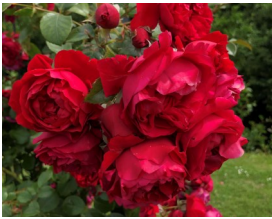
Arborose® Florentina™ - Climbing, 7' h x 3' w

This type of rose grows long, flexible stems that can be trained to grow vertically along supports like trellises or fences. These roses don't actually "climb" on their own like vines do.