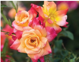
Joseph's Coat - Climbing, 10–12' h