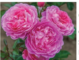
Orchid Romance™ - Bushy, 4½' h x 3' w